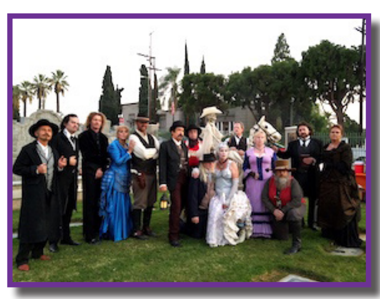
Tales from the Victorian Crypt IV

Dickensian Strollers at the Festival of Lights