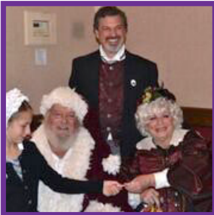
Oliver's Soup Kitchen