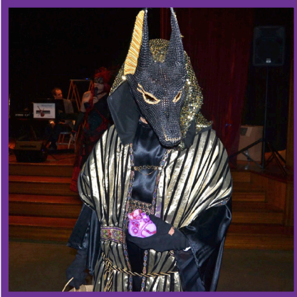
Danse Macabre Masked Ball